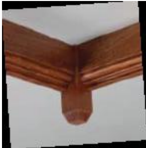
Wall Molding and Corner Medallion