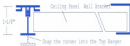
Grid Member Profile